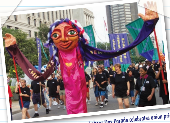
Labour Day Parade celebrates union pride.