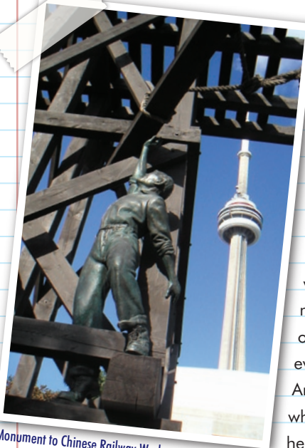
Monument to Chinese Railway Workers

That was true of the Irish who dug the roads and canals, of the Jewish garment workers who worked on Spadina Avenue, of the black railway porters, of the Italian construction workers, the West Indian and Filipino healthcare workers, and today of new Canadians from all over the world working in every part of our economy. And it is also true for those whose families have lived here for generations.